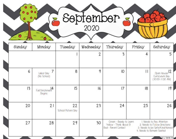
Student Behavior Calendar